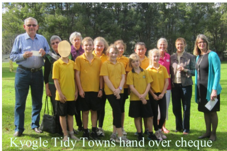
Kyogle Tidy Towns hand over cheque