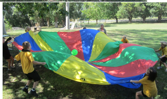
Fun And Games